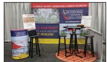
Right: The museum's new name and logo are displayed along with the conceptual drawings of the building at the recent PIA symposium in Daytona Beach.