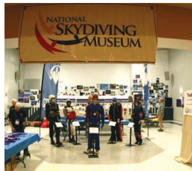
Above: A travelling museum display was open all weekend for guests to enjoy... PIA sponsored an equipment display featuring jump suits and gear through the decades.