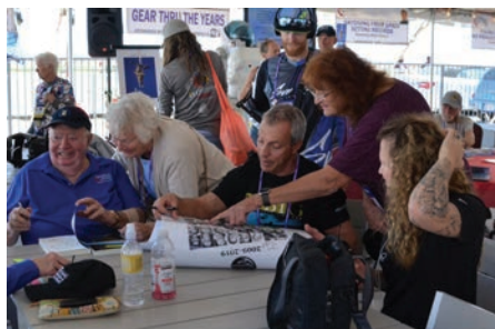
Book Signings