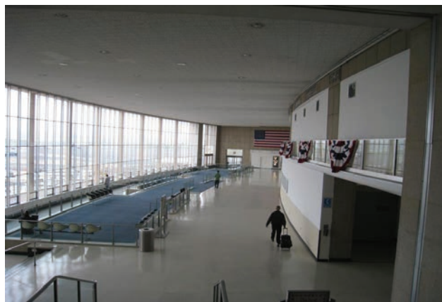
The historic Terminal A at Reagan Washington National Airport is the venue for the 2nd National Skydiving Museum Hall of Fame Dinner.

Seating for the Dinner is limited. There are also numerous sponsorship opportunities to show your support. Details and registration information can be found on the enclosed form.