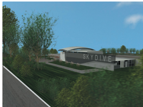
View from I-95

Outside Views - The National Skydiving Museum will be clearly visible from I-95. The museum will provide a stimulating environment with multiple ways for visitors to experience the adventure and wonders of human flight.