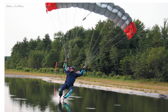
Pond Swooping—one of the many skydiving disciplines showcased in the museum.

The National Skydiving Museum is the brainchild of William "Bill" H. Ottley, one of the best-known figures in the sport. From hard-core skydivers to tandem jumpers to the curious, the 20,000 square foot museum will offer something for everyone. Our purpose is to recognize and promote the sport of skydiving through public education and awareness; recognize the contribution to skydiving by its participants, suppliers and supporters; capture forever the history of the sport via its events, equipment, and personalities; and enhance aviation safety as it pertains to skydiving.