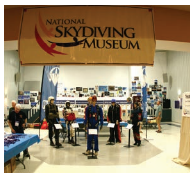
Above: A travelling museum display was open all weekend for guests to enjoy... PIA sponsored an equipment display featuring jump suits and gear through the decades.