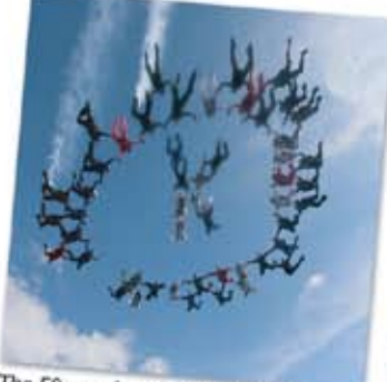
The 50-way formation skydivers form a "K" to honor Joe Kittinger's 50th