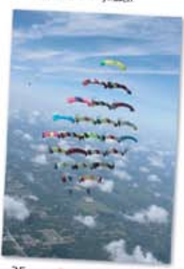
25-way Diamond Canopy Formation