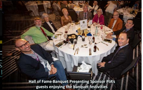
Hall of Fame Banquet Presenting Sponsor PIA's guests enjoying the banquet festivities