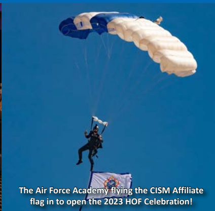
The Air Force Academy flying the CISM Affiliate flag in to open the 2023 HOF Celebration!