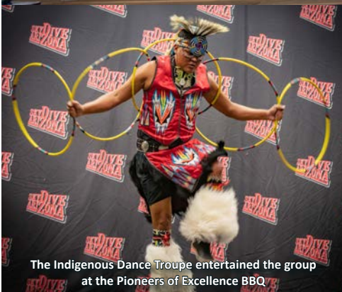
The Indigenous Dance Troupe entertained the group at the Pioneers of Excellence BBQ