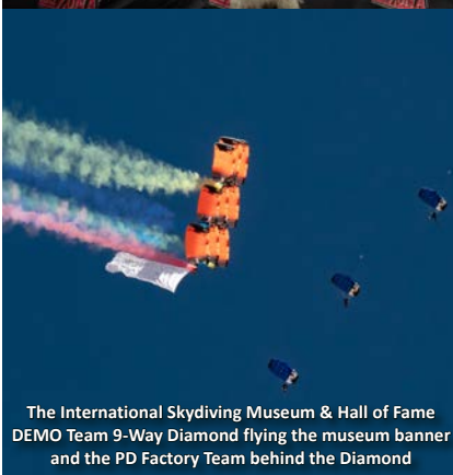
The International Skydiving Museum & Hall of Fame DEMO Team 9-Way Diamond flying the museum banner and the PD Factory Team behind the Diamond