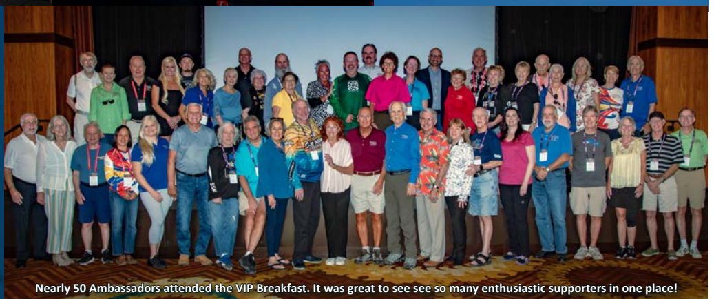
Nearly 50 Ambassadors attended the VIP Breakfast. It was great to see so many enthusiastic supporters in one place!