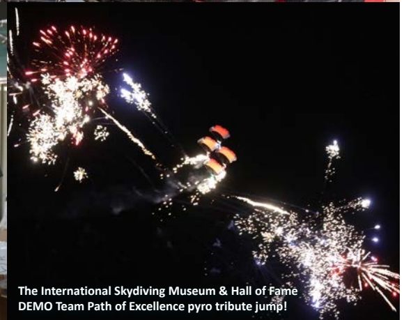
The International Skydiving Museum & Hall of Fame DEMO Team Path of Excellence pyro tribute jump!