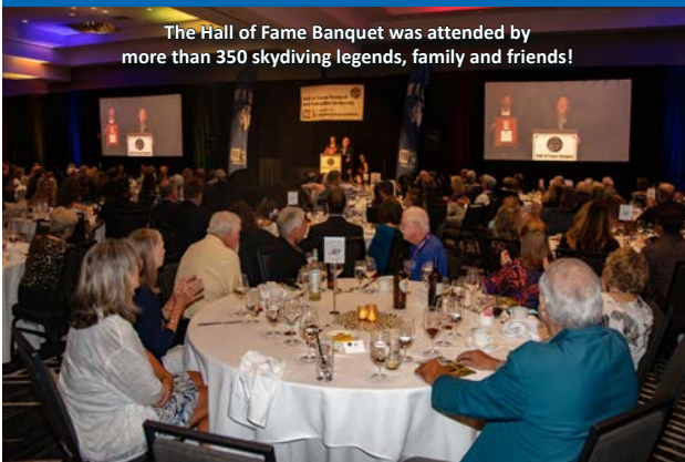
The Hall of Fame Banquet was attended by more than 350 skydiving legends, family and friends!