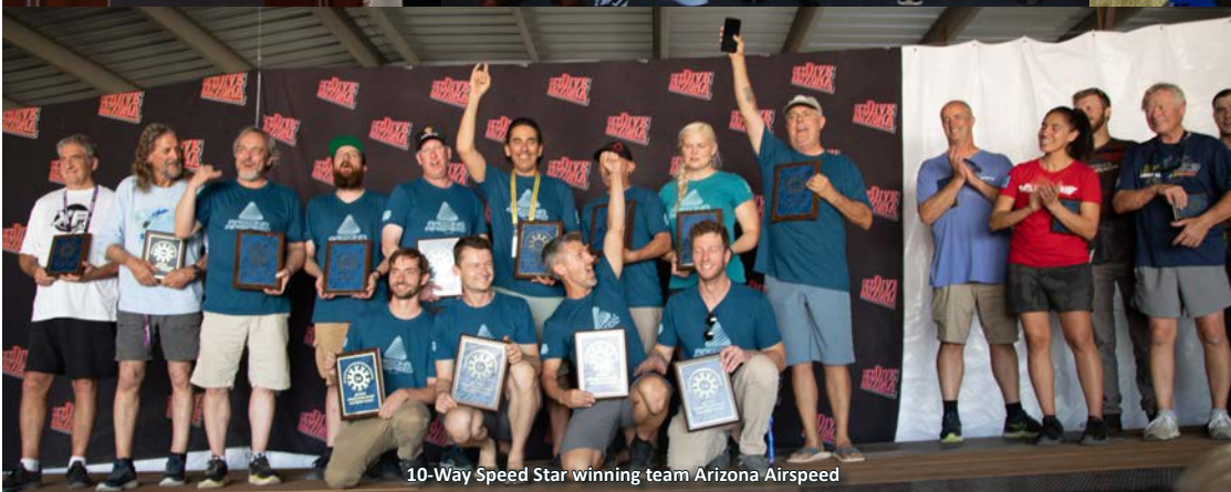
10-Way Speed Star winning team Arizona Airspeed