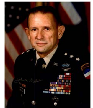
Major General John "Jack" Singlaub Hall of Fame Member 2017