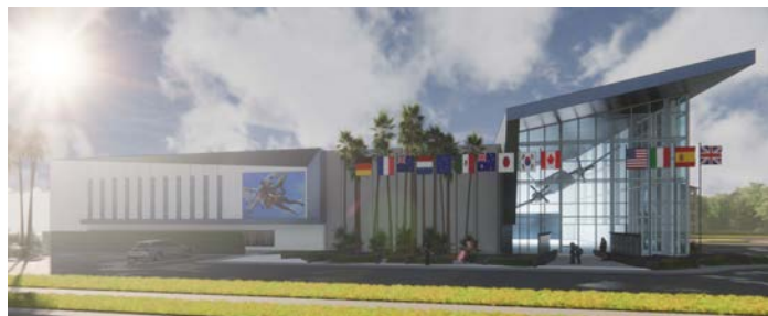
Architectural Rendering of the International Skydiving Museum & Hall of Fame in Kissimmee, Florida